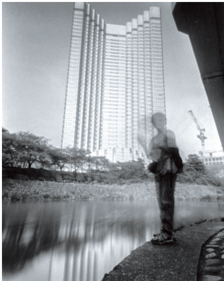
The old view of Tokyo, Grand Prince Hotel Akasaka, 1997