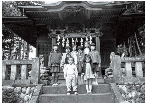
A group of children take time-out from playing to strike a standard Japanese pose at a small shrine on the outskirts of Tokyo, circa 1985.