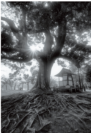
A tree creates its own power spot, honored with a small shrine on an island in Osawa Pond in Kyoto.

them with the same respect for humanity.